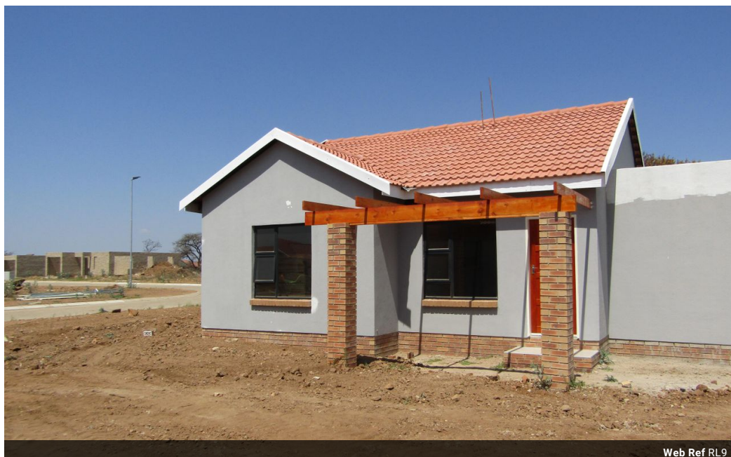
Web Ref RL9

BUILDING 14 (SEFA BUILDING) (ERF 3084), BLOCK D, UNIT GF01B, 11 BYLS BRIDGE BOULEVARD, HIGHVELD EXT 73, CENTURION, 0157