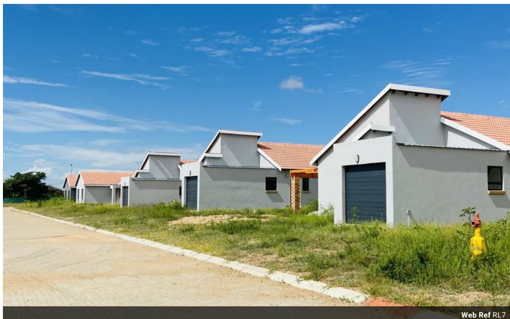
Web Ref RL7

BUILDING 14 (SEFA BUILDING) (ERF 3084), BLOCK D, UNIT GF01B, 11 BYLS BRIDGE BOULEVARD, HIGHVELD EXT 73, CENTURION, 0157