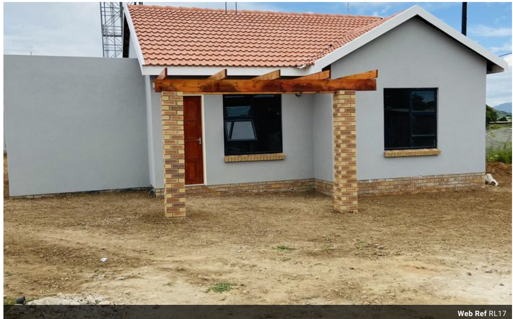
Web Ref RL17

BUILDING 14 (SEFA BUILDING) (ERF 3084), BLOCK D, UNIT GF01B, 11 BYLS BRIDGE BOULEVARD, HIGHVELD EXT 73, CENTURION, 0157