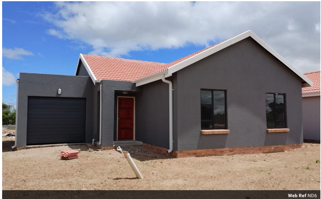
Web Ref ND6

BUILDING 14 (SEFA BUILDING) (ERF 3084), BLOCK D, UNIT GF01B, 11 BYLS BRIDGE BOULEVARD, HIGHVELD EXT 73, CENTURION, 0157